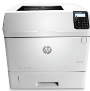
HP LaserJet Enterprise M605n

Accelerate business results with outstanding print quality. Tackle large jobs and equip workgroups for success wherever business leads. 2 Easily manage and expand this impressively fast, versatile printer—and help reduce environmental impact.