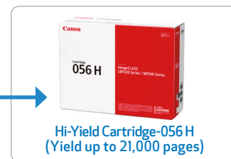
Hi-Yield Cartridge-056 H (Yield up to 21,000 pages)

Use of Canon GENUINE toner cartridges helps provide longer equipment life, high yields, reliable performance, high-quality output, and minimal jamming or issues.