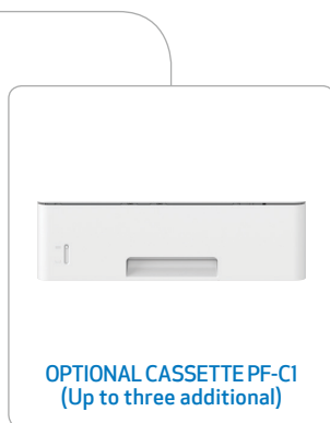
OPTIONAL CASSETTE PF-C1 (Up to three additional)