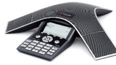
Polycom SoundStation Conference Phones