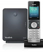
Yealink DECT Cordless