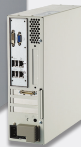
imagePRESS Server G100