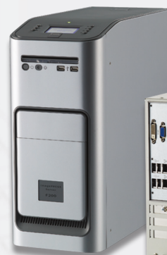
imagePRESS Server F200