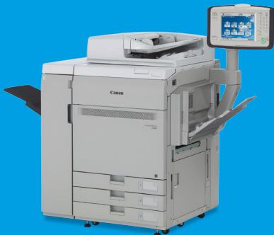
imagePRESS C65 shown with optional accessories.