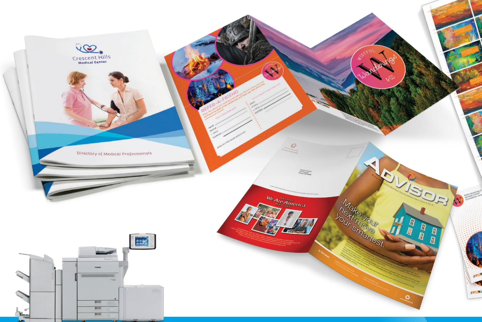
Engine shown with optional accessories.

COMBINING DURABILITY, PRODUCTIVITY, AND VERSATILITY WITH AFFORDABILITY